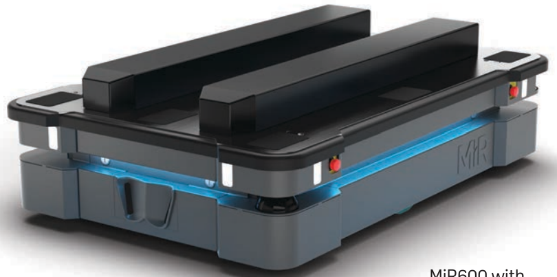
MiR600 with EU Pallet Lift 600

With increased ability to withstand dust particles and fluids, the MiR600 & MiR1350 are industrial, safer, and more reliable than any other AMRs, and they can be used in more environments.